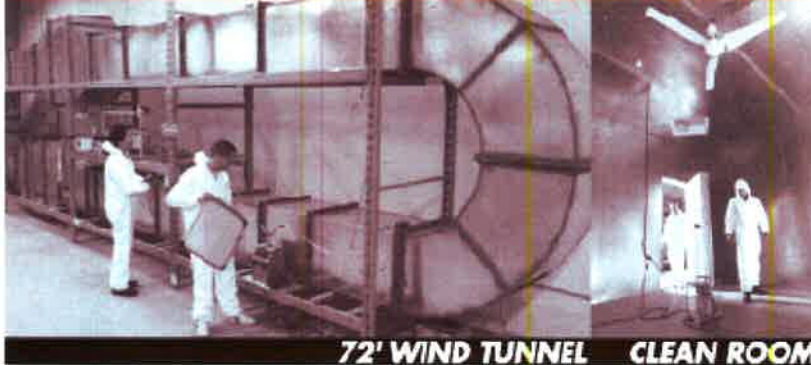
72' WIND TUNNEL