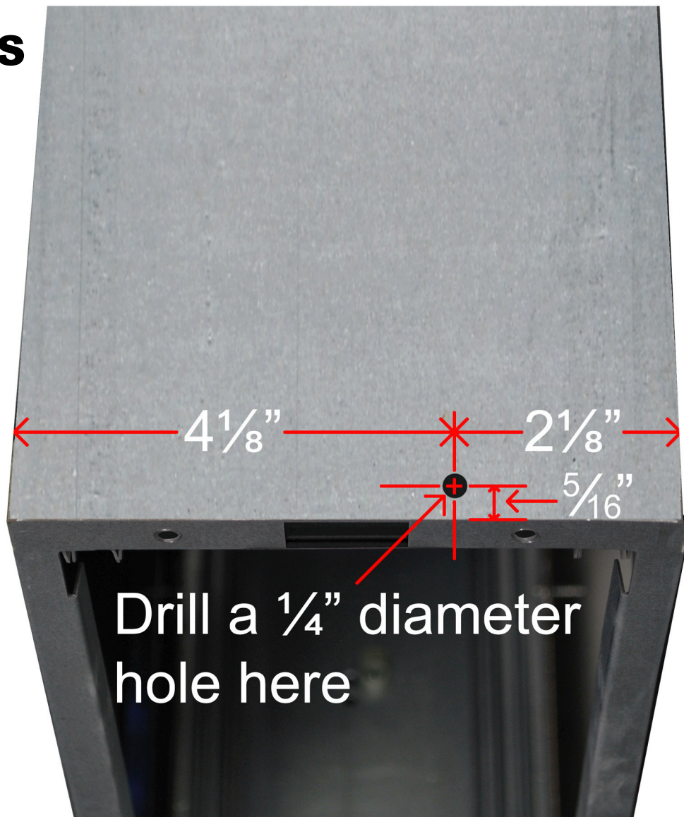
Air Cleaner Cabinet TOP

The purpose of the Air Flow Sensor is to turn on the air cleaner when your furnace fan is running.